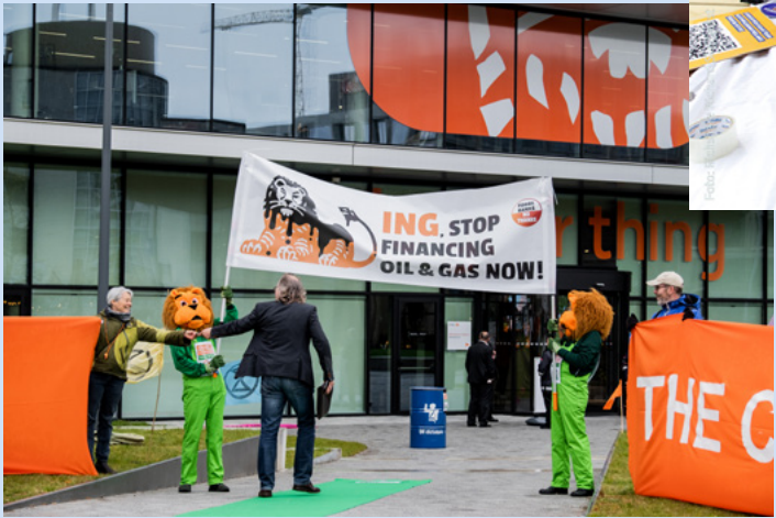
The iconic lions of ING greet shareholders at their annual meeting.