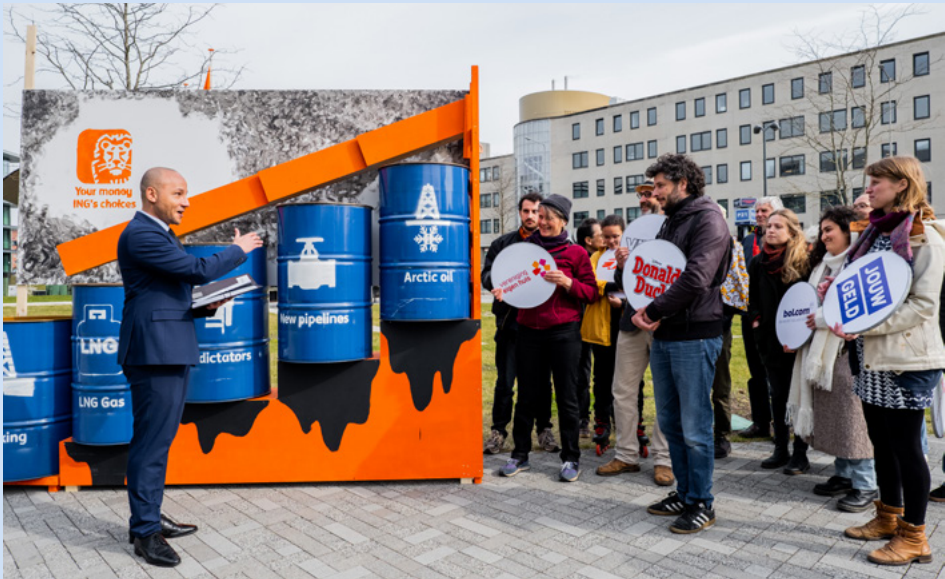
At the launch of the ING Fossielvrij campaign, euros roll into a giant piggy bank made of oil barrels.

We have actively shaped the public discussion on ING's climate policy, on social media as well as in multiple opinion pieces in Het Financieele Dagblad (the Dutch Financial Times). One of these op-eds has led to parliamentary questions. Furthermore, the campaign was covered by Trouw (national newspaper) and Kassa (TV-programme).