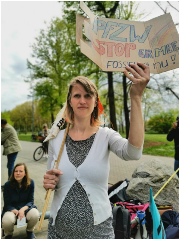
Earth Day.