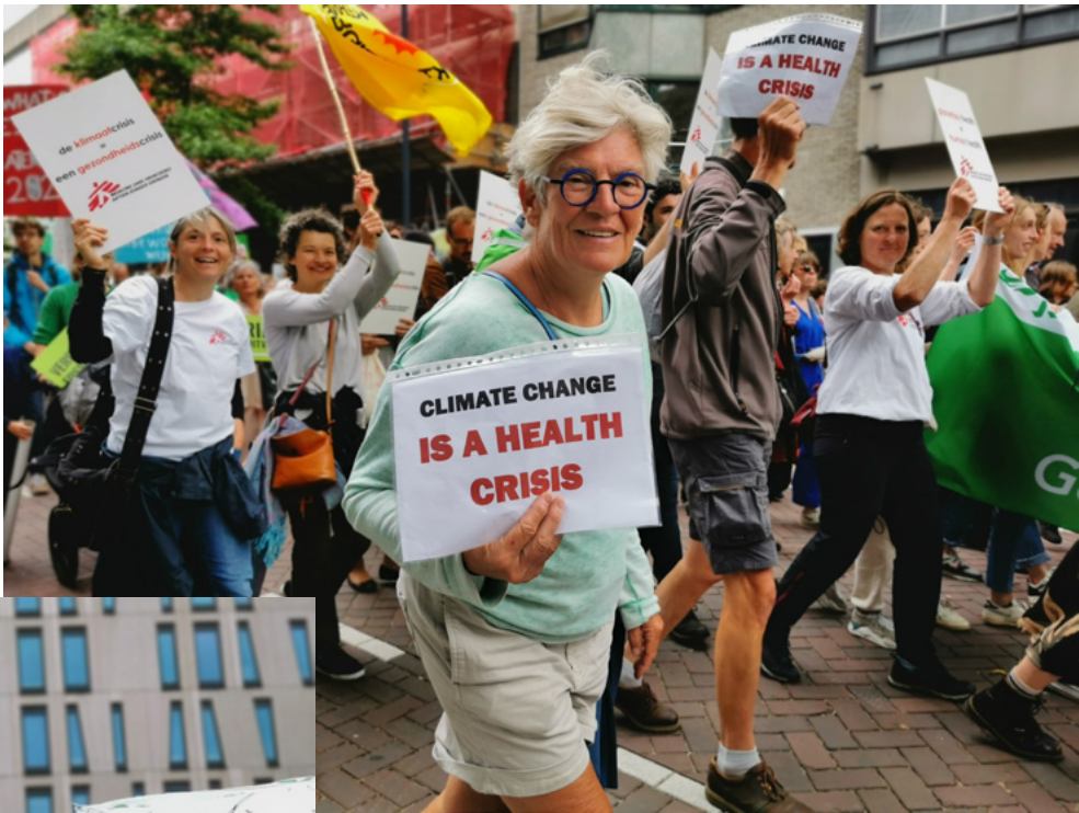
At the climate march in Rotterdam, health care professionals emphasise that the climate crisis is a health crisis.