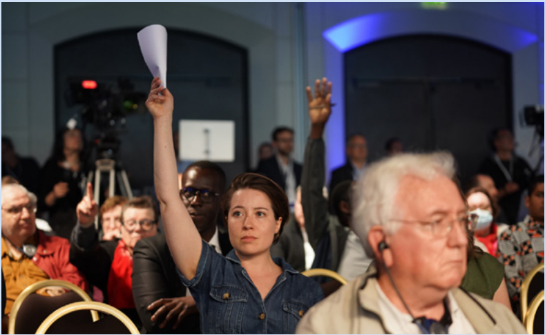
During the annual shareholders’ meeting of KLM, we announced that we would take the airline to court if they would not stop their misleading ‘green’ communication.

Last but not least, we gave a speech at the sustainable award ceremony of Dutch newspaper Trouw, since the ABP Fossielvrij campaign had won the previous year. During this speech, we called for Trouw to stop publishing fossil fuel related advertisements such as those promoting cheap flights.