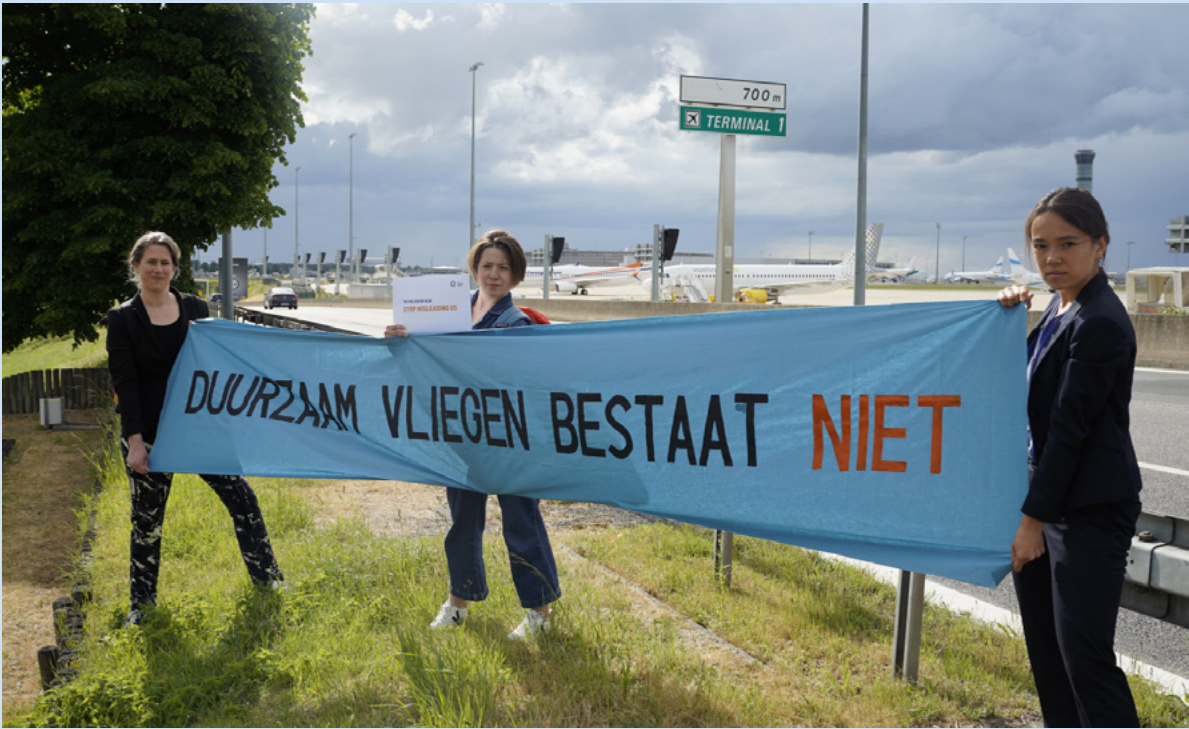
Together with Reclame Fossielvrij, we traveled to Paris to announce the lawsuit.