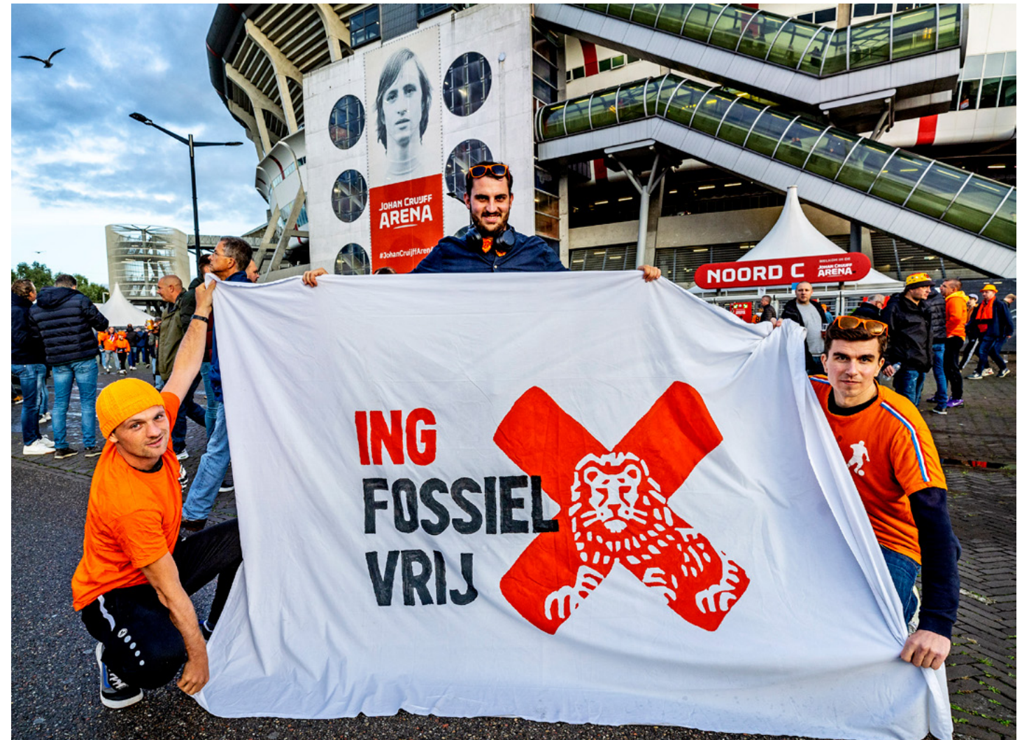
First action of Fossil Free Football before a match between the Netherlands and Belgium.

The focus of Fossil Free Football was on starting and growing the movement. The first actions attracted quite some attention from the media and on social media. One of the highlights was taking FIFA to the advertising authority for falsely claiming the Qatar World Cup is carbon neutral.