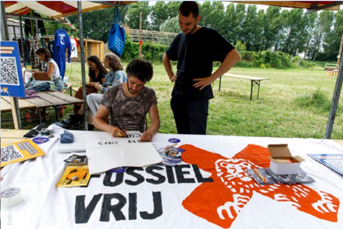
ING Fossielvrij hosts a workshop at the Midsummer Activism festival at cultural free haven Ruigoord.