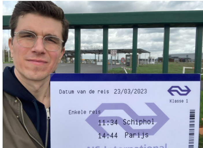
To criticise an unnecessary flight by the Dutch national men's team, Frank cycled all over Paris to hand them a symbolic train ticket.