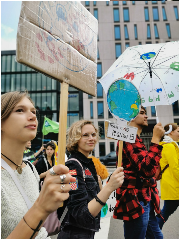
10.000 people demand climate justice at the national climate march in Rotterdam.