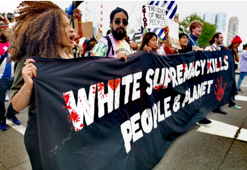
The climate march in Rotterdam united a wide range of groups working on climate justice, headed by the decolonial anti-racist block.

We are proud that we build bridges, trust and relationships between these organisations and groups in the climate justice movement. We play a key role, since we are centrally positioned between the established environmental NGOs like Milieudefensie and Greenpeace and the grassroots climate groups like Extinction Rebellion and Fridays for Future.