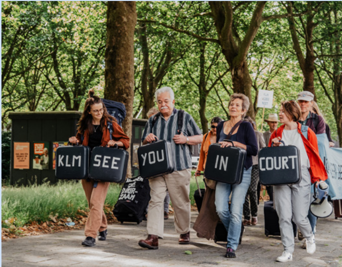
During the ‘KLM trial walk’, we brought the writ to the Amsterdam court.