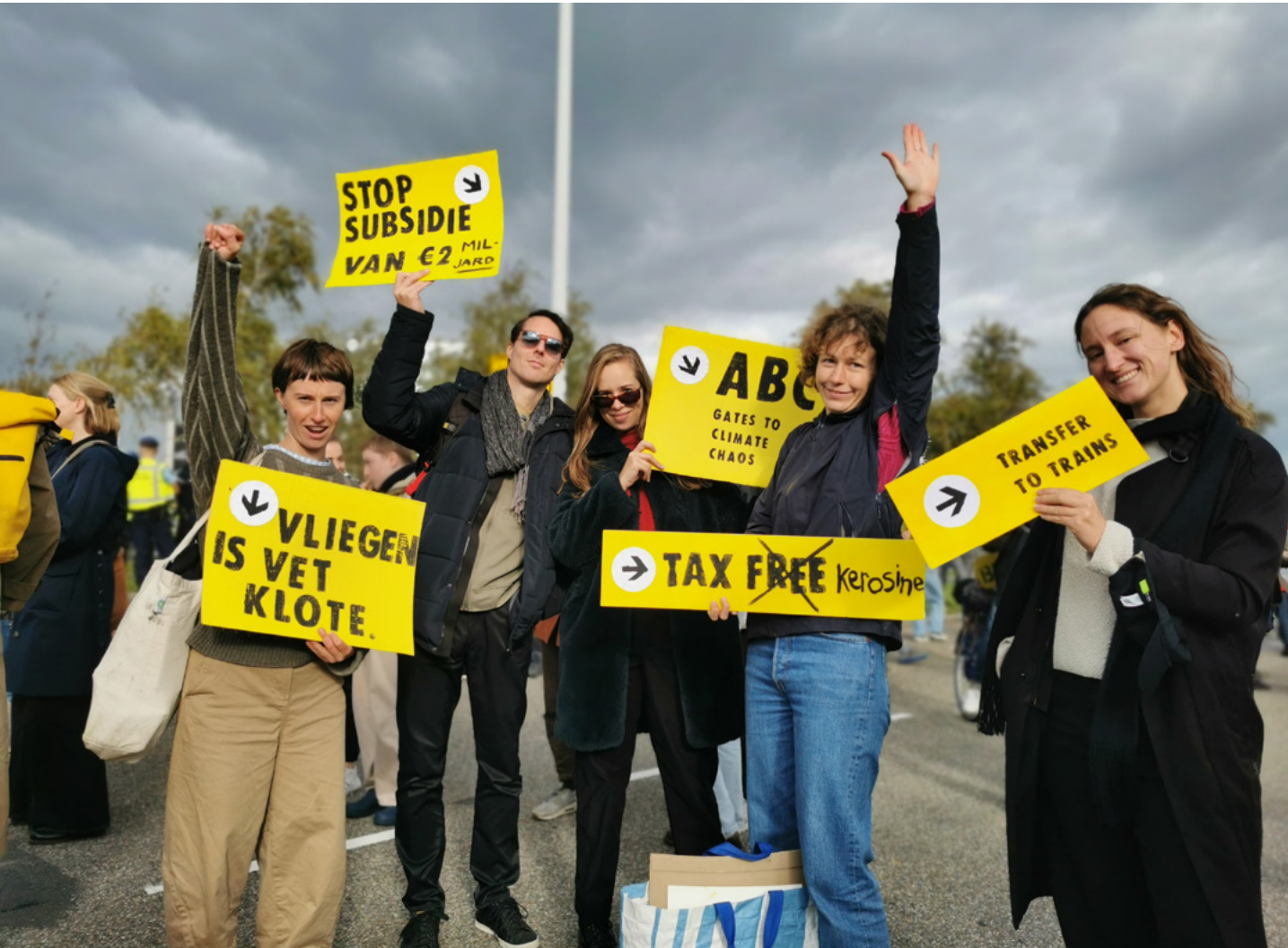
Protesters took their own take on the signage of Schiphol Airport at a demonstration for air traffic degrowth.

In addition, we have become a member of Stay Grounded: an international network of organisations fighting greenwashing and promoting alternatives to aviation to address climate change.