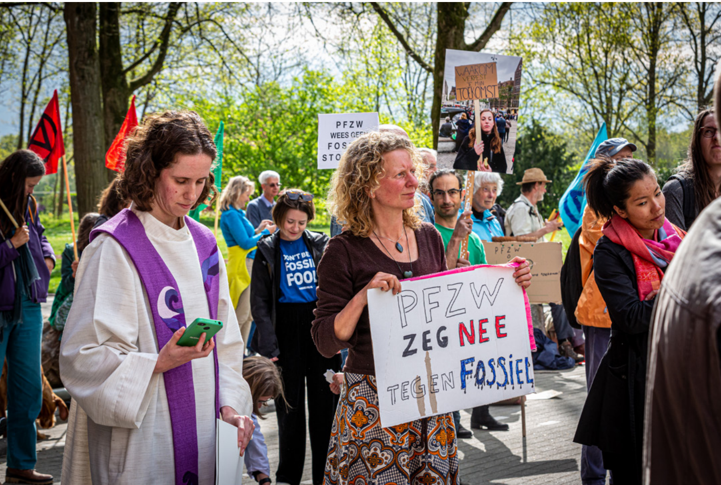
Together with pension members of PFZW and partners such as Groen Pensioen and Extinction Rebellion, we took the streets on Earth Day.

On the subject of shareholder power: we have stimulated pension funds to invest in shareholder engagements with banks. Also, we have investigated how ABP and PFZW voted on climate resolutions and we have addressed this directly to our contacts. As a result, ABP has sharpened their voting policy in April 2023. Another success with ABP was the selection of five 'green' candidates for their accountability body, which we had promoted on our website and email list.