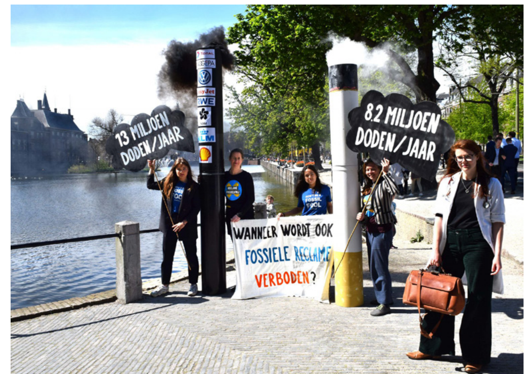
Reclame Fossilvrij in front of the prime minister's office, with signs comparing deaths from smoking to deaths from fossil fuel emissions. When will fossil fuel advertising be banned, just like we did with tobacco?